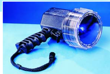
(Top) Model FS10-R30 flame detectors with air shields and Nordson relay/indicator panel; (Inset) Optional test lamp.