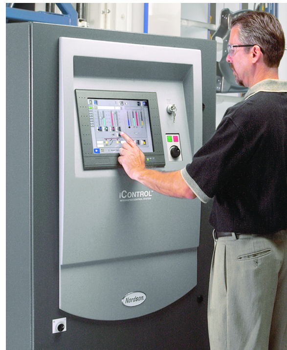
The iControl® system gives powder coaters enhanced capabilities for optimal system performance and maximum line efficiency.

For reciprocator control , features include user-programmable presets for variable-stroke speed and variable-stroke length. Reciprocator control provides additional flexibility and greater control for varying part heights and part speeds.