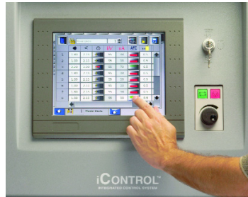
Application parameters include flow and atomizing air, electrostatics settings, and settings for gun triggering.

Gun control is easy in either manual or automatic mode allowing control of flow rate, atomizing, KV and current for individual guns, or all guns through use of the “copy all” function. Similarly for gun status, individual guns or all guns at one time can be viewed to display gun parameters and presets for various part styles.