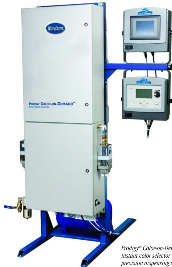
Prodigy® Color-on-Demand® instant color selector is designed for precision dispensing and ultra-fast contamination-free color change.