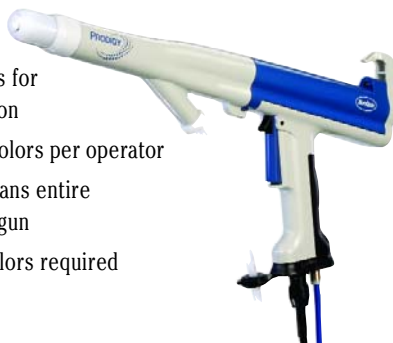
Prodigy® manual spray gun is automatically purgeable with either continuous or pulse purge.