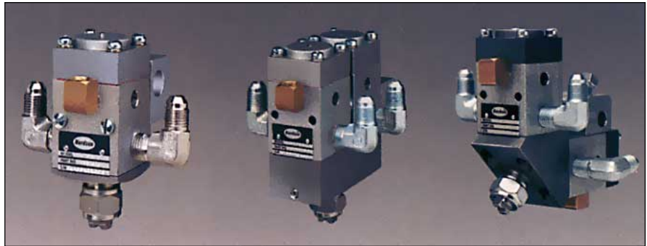
Nordson A7A guns are available in single (left) and dual chamber (center) versions, as well as dual-chamber angled (right) models.