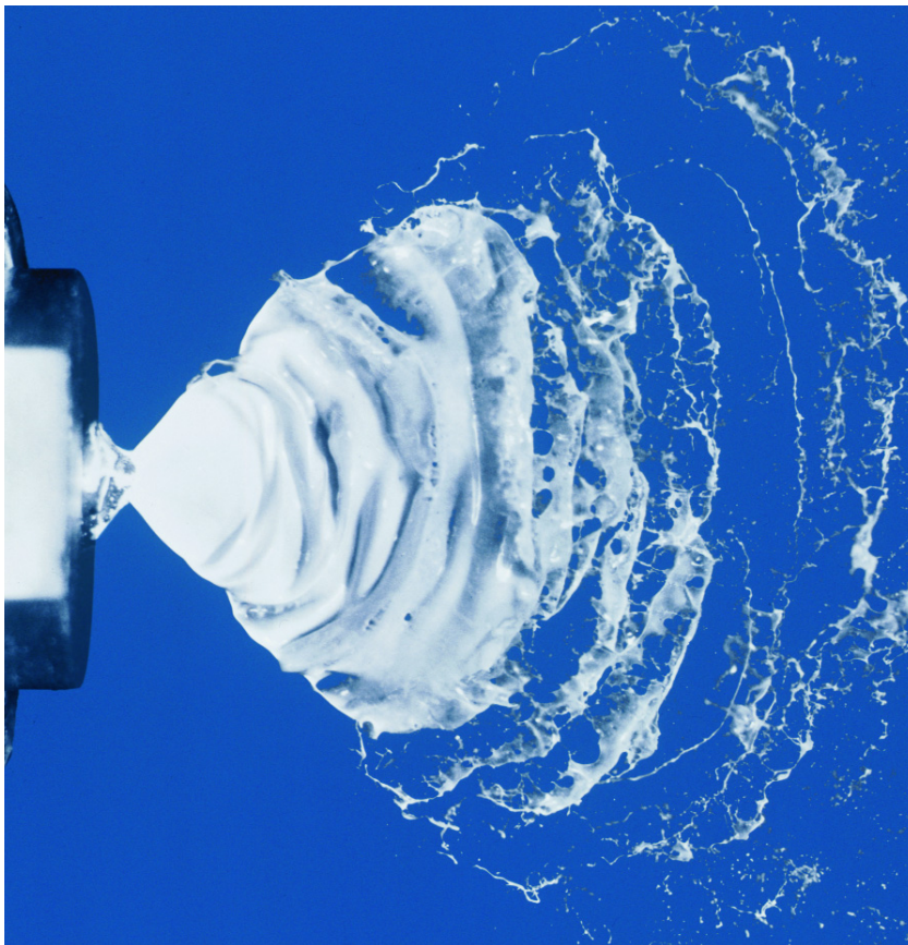
Airless atomization begins with a fluid film that becomes unstable as it meets air resistance. Stop action (above) shows progressive disintegration into ligaments (connecting strands) and then into droplets.