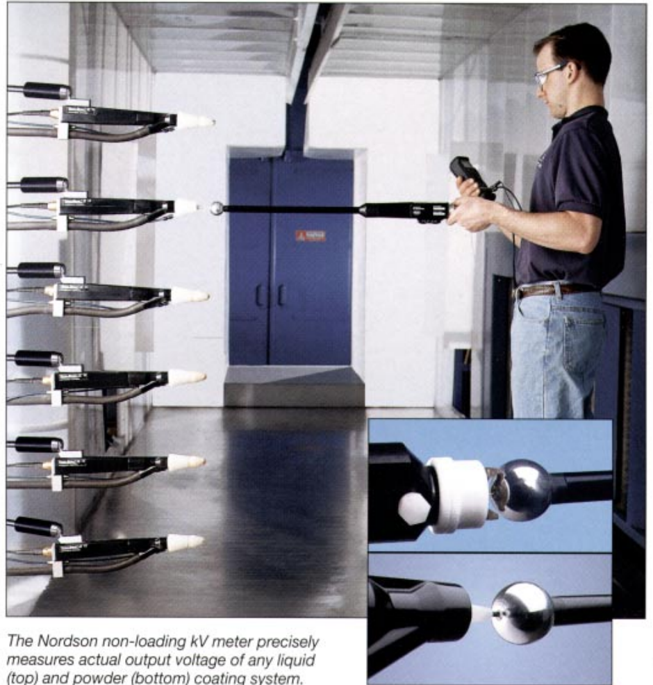
The Nordson non-loading kV meter precisely measures actual output voltage of any liquid (top) and powder (bottom) coating system.

gauging can hinder system diagnostics, troubleshooting and maintenance, and impede the performance and efficiency of your coating operation.