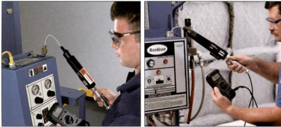
Flexible cable attachment measures voltage inside high-voltage power supply for powder (left) and liquid (right) coating application systems.